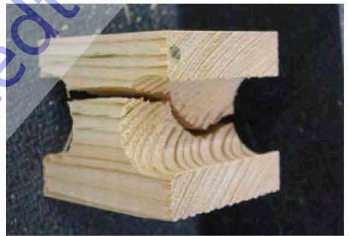
FIG. 32 Tension-Perpendicular-to-Grain Test Specimen